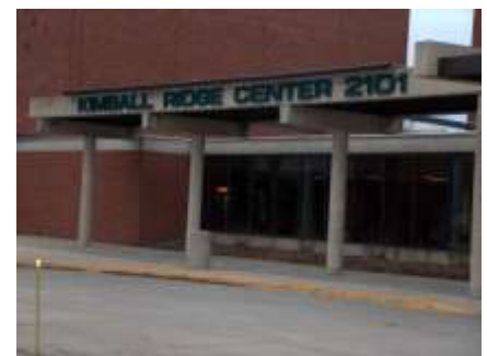
Kimball Ridge Center

The Touch of Courage Breast Cancer Support Group continues to meet on the first Monday of every month (unless it's a holiday). They meet at the Kimball Ridge Center on 2101 Kimball Avenue. The meetings are held at 1:30 and 5:30 p.m.