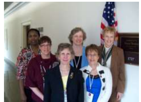
BPT Members at the National Breast Cancer Coalition Advocacy Conference April 30-May 3 in Washington DC